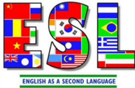
Volunteer - ESL