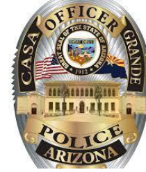
Shield a Badge