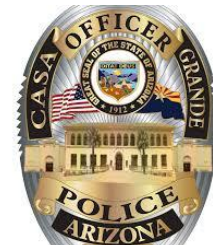
Shield a Badge