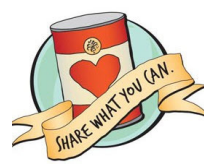
Community Food Pantry