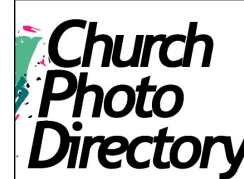
Church Photo Directory