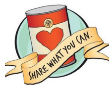
Community Food Pantry