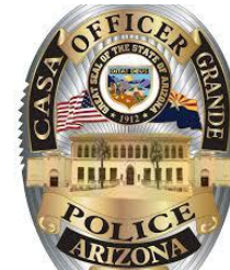
Shield a Badge