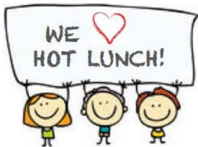
Eloy Free Hot Lunch Program