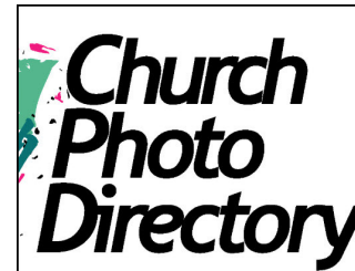
Church Photo Directory