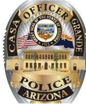
Shield a Badge