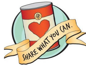
Community Food Pantry