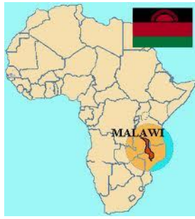
Good Gifts Ministry