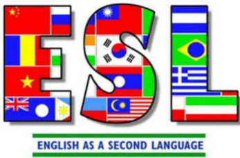
Volunteer - ESL