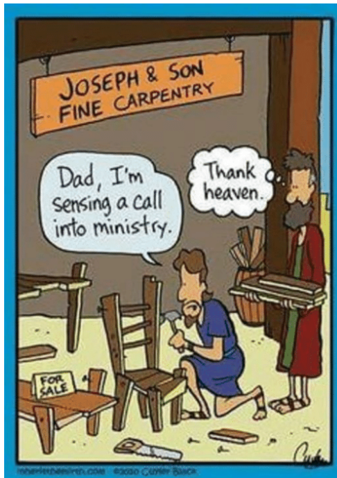
A little Father's Day humor (Cartoon by Inherit the Mirth)