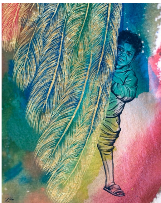
"Under God's Wing"

Having been told that Herod wants to kill him, Jesus compares Herod to a fox. Jesus shrugs off the threat and invites the people of Jerusalem to be gathered under his wing. This is not how most of us respond to the threat of bodily harm, is it? Our normal response is to protect ourselves. Whether its locks on our doors, hand sanitizer, a self-defense class, a home security system, or an N-95 mask, when threatened, we seek protection. Instead, Jesus gives us an image of God that we can hold onto when fear comes knocking on our door and bullies threaten to victimize us. Jesus compares himself to a mother hen. Hens gather their chicks and give them a place of warmth, tenderness, and belonging. On the one hand, it's a beautiful and comforting image. But we also know that foxes eat hens. In fact, a hen cannot stop a determined fox from harming them or their children. So what good is Jesus' promise to us vulnerable chicks in a world full of foxes? Maybe the antidote to fear isn't safety. What if it's love? Love doesn't prevent us from being harmed, but when we are embraced by divine love, then there really is nothing to be afraid of. In our lives, danger is not optional, but fear is, because the opposite of fear isn't bravery, it's love. Friends, in this world, there will be foxes, but amidst all the dangers you will ever face, God gathers you under her wing in warmth, tenderness, and belonging, both now and forever.