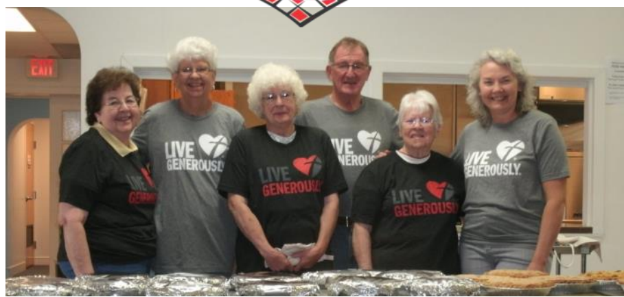
WELCA hosted a pie sale in March selling blueberry and lemon sponge pies.