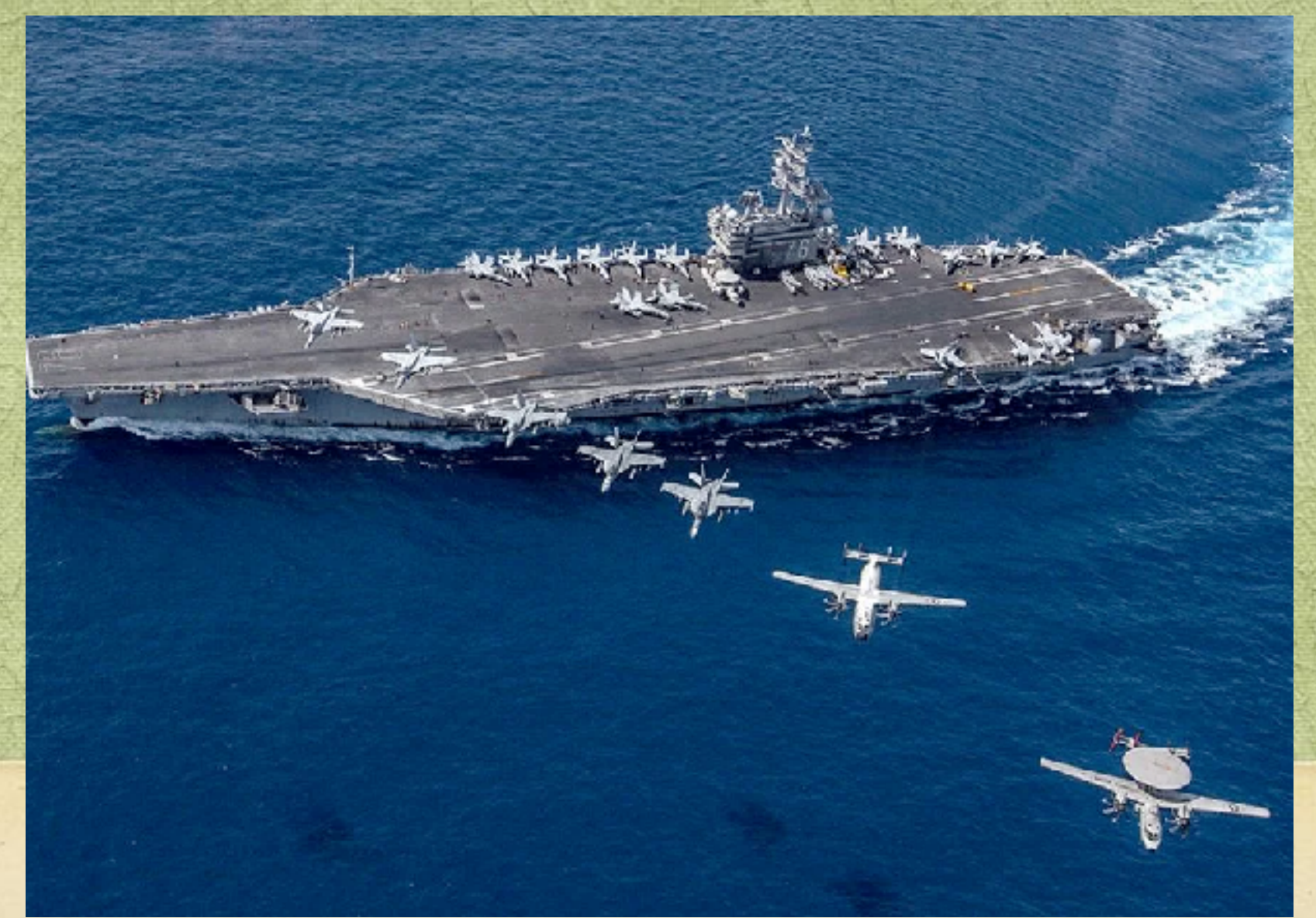
Battle Stations! Proverbs 5-7