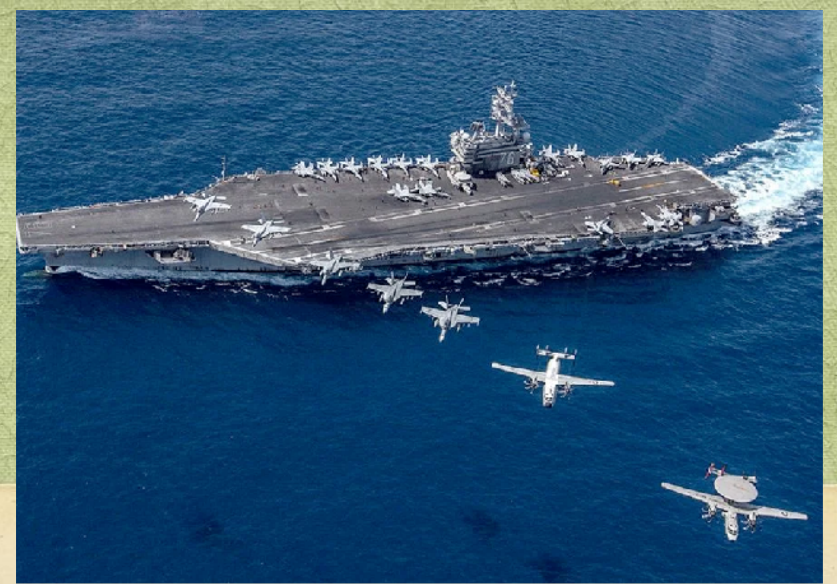
Battle Stations! Proverbs 5-7