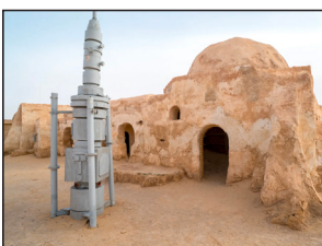
Tunisia was the set for Tatooine - Luke Skywalker's home planet.