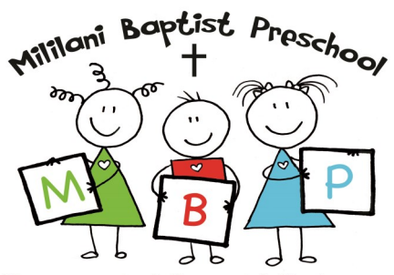
"I am wonderfully made" (Psalm 139:14).

Wow, we can't believe that it is officially summer time! Where did the school year go?! We ended our preschool year with a very different ending! On May 27th at 2pm we had our Nai'a Graduation! All of our graduates came out to