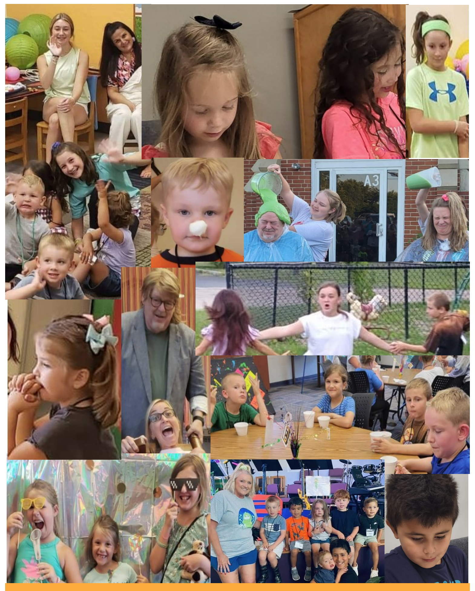
FOR MORE PICTURES VISIT THE HOPEFUL CHILDREN & FAMILY MINISTRIES FACEBOOK PAGE