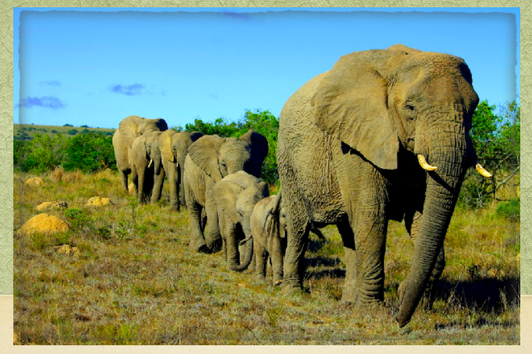
Lead, Follow, or Get Out of the Way! Selected Proverbs