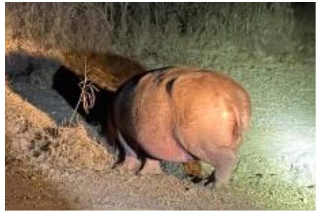
Unexpected nighttime “meeting” with hippopotamus