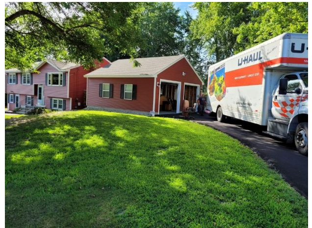
Old house in Dracutt, MA