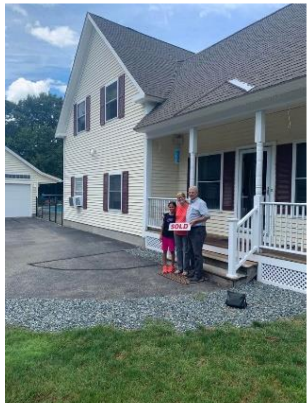
New house in Concord, NH