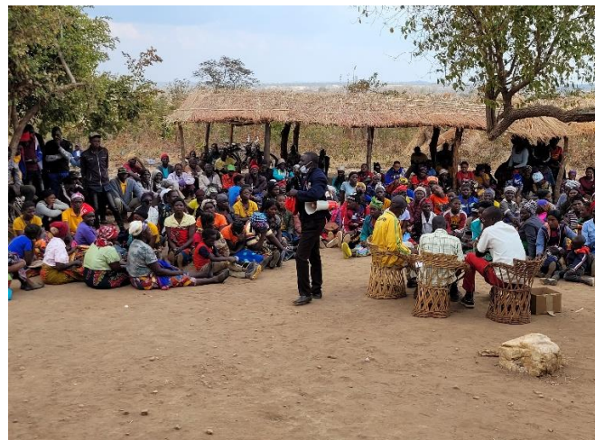
100+ people exposed to the truth of the gospel each day through medical clinic outreach

New Address: 40 Lawrence St, Concord, NH 03301