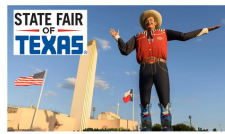
MCBC Senior Adult Day Trip Thursday, October 13, 9:00am to 5:00pm