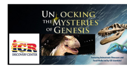
MCBC Senior Adult Day Trip Friday, November 18, 9:00am to 5:00pm

The seniors of MCBC will be taking a day trip to view the Fall colors at the Dallas Arboretum on Friday, October 28 . Thousands of pumpkins will line the walkways as you experience the beauty of the surroundings in the Botanical Gardens. Anyone planning to participate in this trip must be registered by Sunday, October 23rd. Limited spaces available.