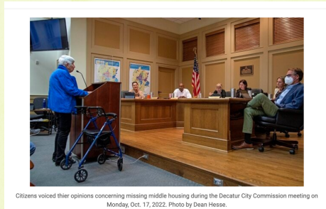
Citizens voiced their opinions concerning missing middle housing during the Decatur City Commission meeting on Monday, Oct. 17, 2022.