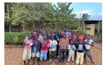
The twenty-four kids received a notebook and pen