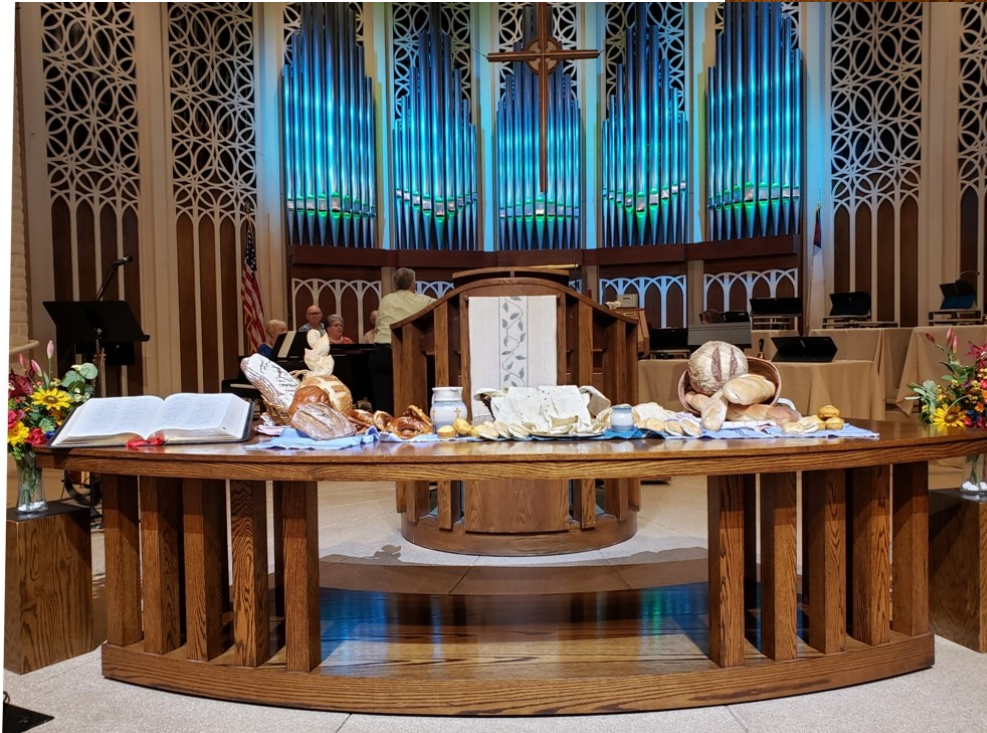
World Communion Sunday October 2, 2022