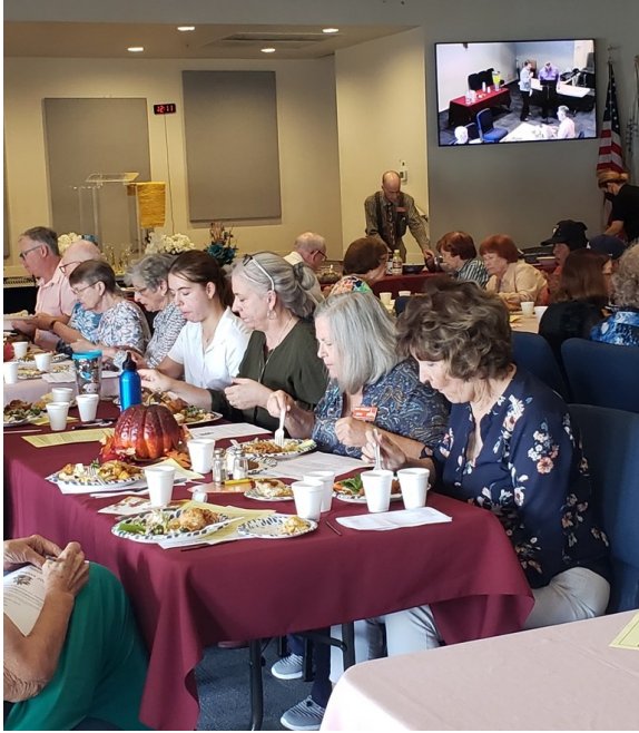
2022 Annual Meeting