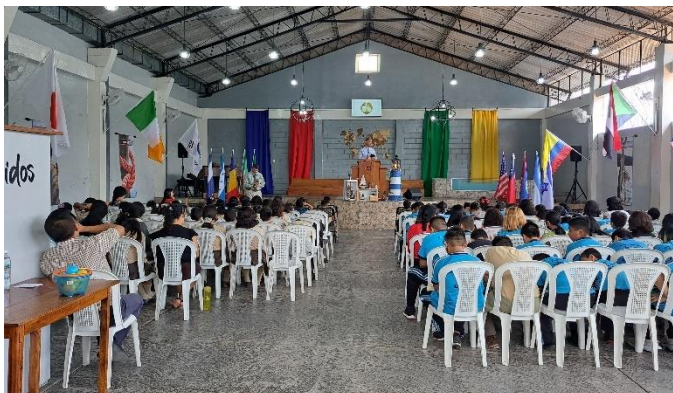
Chapel at Emmanuel Baptist School during the week of the missions conference.

“For we are his workmanship, created in Christ Jesus unto good works, which God hath before ordained that we should walk in them.”