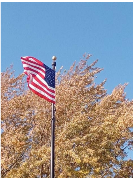
By Jacob Flom

Some of our young kids took pictures of "The Beauty of Creation" around the church last month.