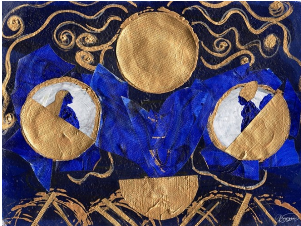
"The Golden Cradle"