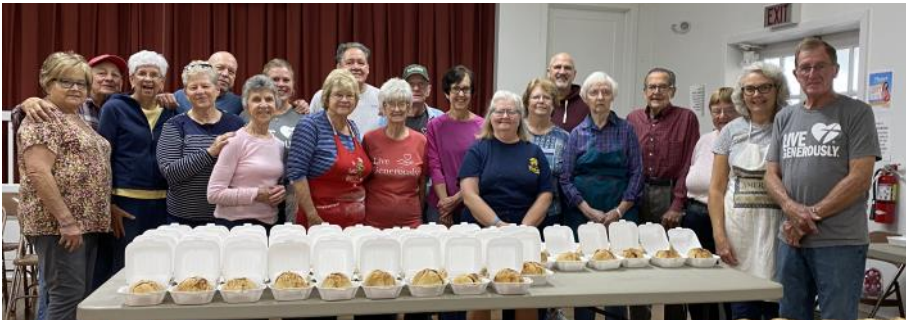
Apple Dumplings! Thank you to all the volunteers, sponsors and purchasers of the delicious Apple Dumplings!