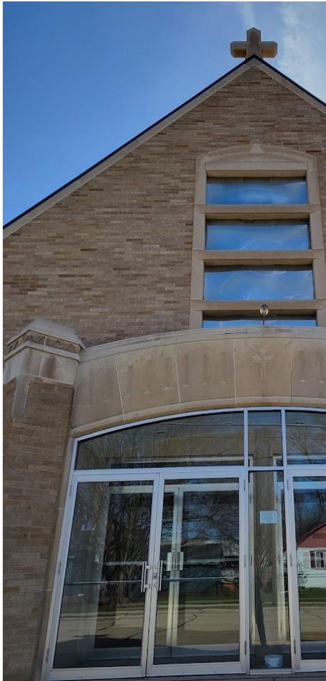
Peace Church 120 years later in 2022