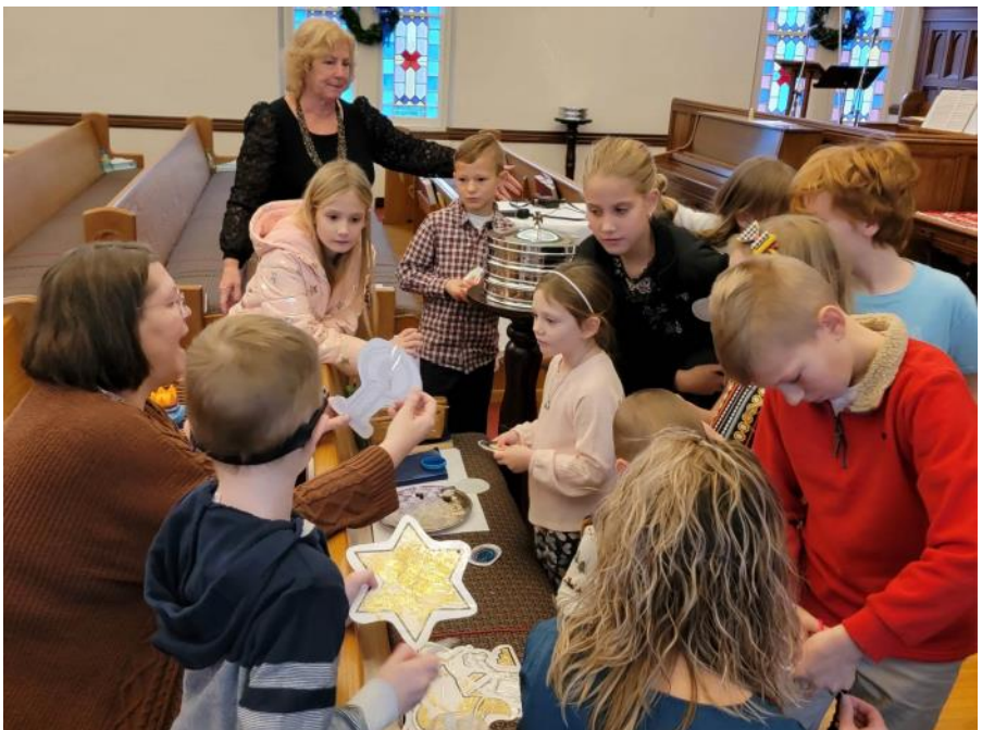
Decorating for Christmas —Adults and youth gathered to decorate the Sanctuary for Christmas.

...ers on the list and arrange a swap. Please notify the church office of the change.