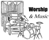
Worship & Music

Planning: Worship & Music will meet on Wednesday, January 18th at 3:30pm.