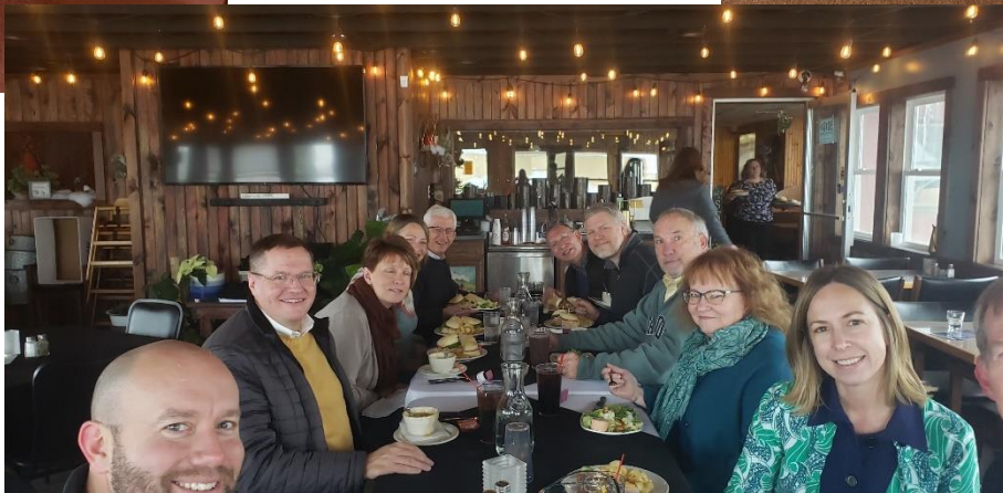
Cannon River Conference pastors meeting hosted by Dennison Lutheran, (with lunch at the Fireside)