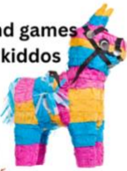
Piñata and games for the kiddos