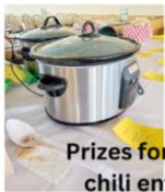
Prizes for top 3 chili entries