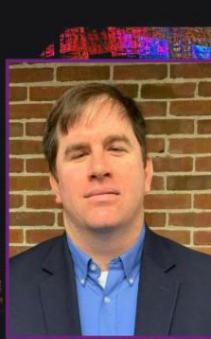
Racine Brown March 8; 7:00PM